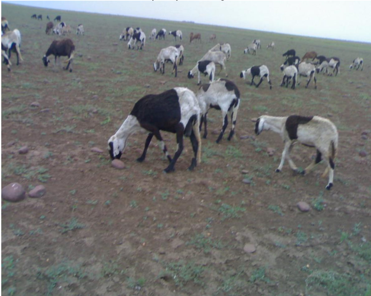
Plate 1: The open rangeland of the Butana