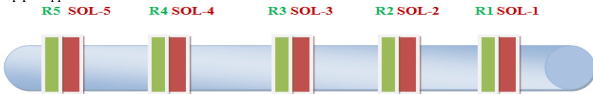
Figure (2) A pipe line model mounted with five pairs of solenoid valves plus rate of flow sensors.

The proposed model assumes the installation of five solenoid valves (SOL-1 to SOL-5) and five rate of flow sensors (R1 to R5) are to be installed on the petrol pumping pipe are shown on figure (2) below. The spacing between a pair of solenoid valve plus rate of flow sensor and the other pair on the pipe is assumed to be equal to one meter. The solenoid valves are controlled remotely by the embedded system. The rate of flow sensors are wireless sensors. A (DTMF) electronic circuit is used to control remotely the operation of the solenoid valves. Once saboteurs attack the petrol pipe line, the system responds immediately by stopping the pumping and closing the nearest solenoid valve to the leakage of petrol. The same thing happens when an accidental leakage in pipe happens.