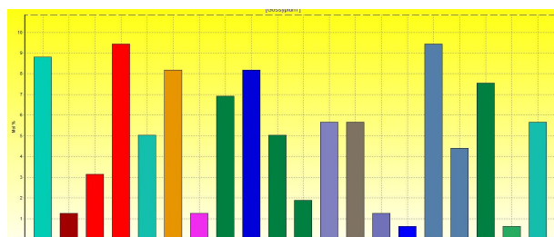
Fig 3: Amino acids composition of cottonseed cake

207, 17306.5-159 and 16135.5-141 for SFC, GNC and CSC, respectively. The result indicated that the SFC had a higher molecular weight includes higher percentages of alanine, glutamine, leucine and arginine, while it had lower percentages of valine, lysine, threonine, serine and phenylalanine amino acids. The CSC recorded medium molecular weight and amino acids concentrations and signed sub-optimal percentages of threonine, glutamic acid, serine, methionine and leucine, but was low in cysteine, histidine, glutamine, arginine and tryptophan. The GNC had protein of high level in valine, glutamine, leucine, arginine and serine, low in lysine, isoleucine and tyrosine and tryptophan did not detected for GNC. The result of software technique classified groundnut cake as unstable protein while cottonseed cake and