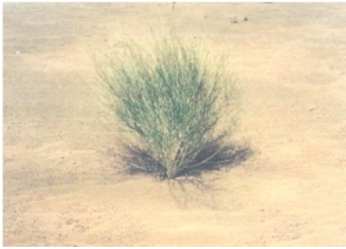
Plate 2b: Leptadenia pyrotechnica