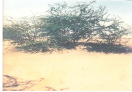
Plate 3: Prosopis juliflora