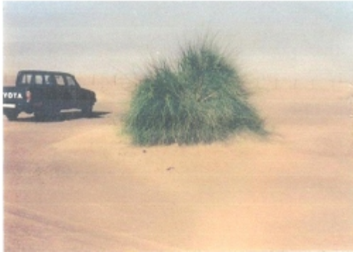
Plate 2a: Leptadenia pyrotechnica