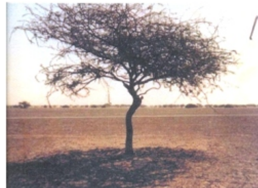
Plate 1: Acacia tortilis

Panicum turgidum was very small and rather impermeable, particularly near the surface, while its permeability increases sideward and upwards compared to the other species selected. During north wind the amount of sand of stand No. 3.1 was larger than that of 3.2, on leeward. Windward for both trees the area was eroded (Table 3). As the wind direction changed (south wind), all deposits of stand No. 3.2 had been removed (windward was eroded) while some of that of stand No. 3.1 remained, which again can be attributed to the smaller permeability of tree 3.1. Stand No. 3.3 was very small.