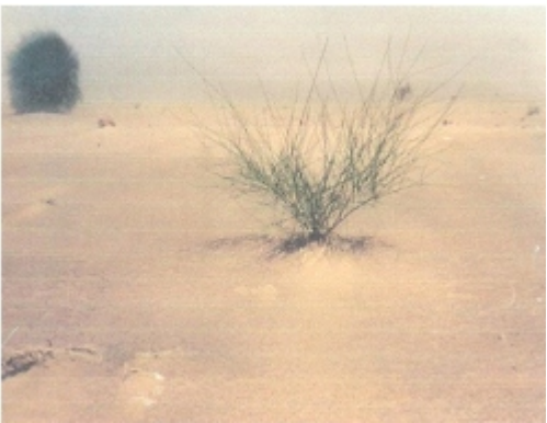
Plate 2c: Leptadenia pyrotechnica

complete eradication because they are considered too aggressive, which could will be an advantage under this condition conditions. Panicum turgidum (Plate 4) has high efficiency of collecting and capturing moving sand relative to their small sizes, in particular when found in association and advantage is that they are naturally present in relative abundance.