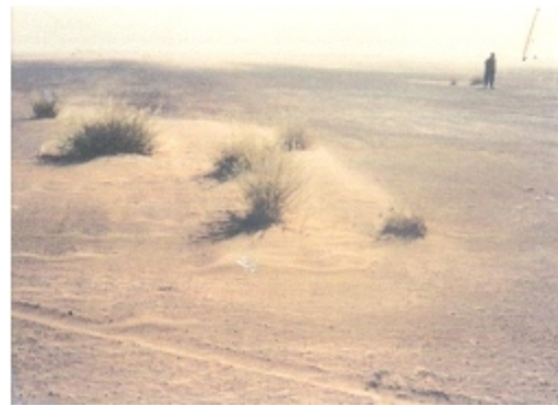
Plate 4: Panicum turgidum